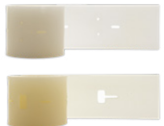
4 Spare suction lips front and rear