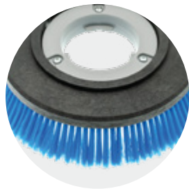
Driving plate with brush rim as splash guard