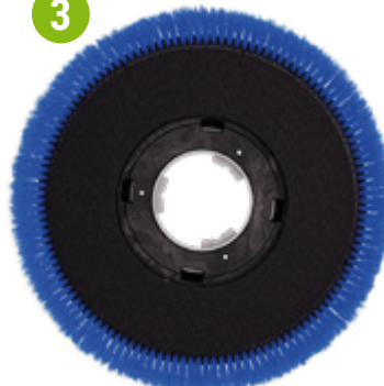
3 i-mop XXL drive plate