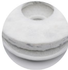
Firm fleece back