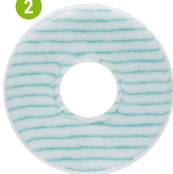
2 PolyPlusPads with high-quality outer band