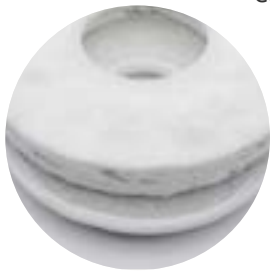
firm fleece back